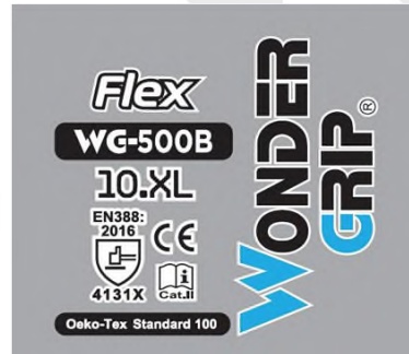
Levels of performance / class of protection