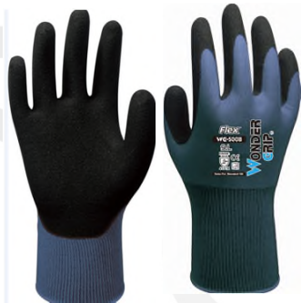
Reference standard :