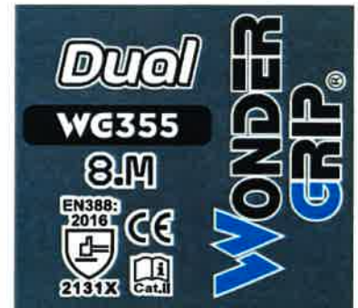
Reference standard :